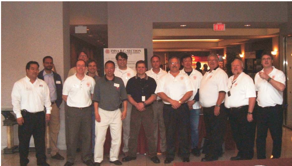
IMSA B.C. SECTION EXECUTIVE BOARD 2008 - 2009